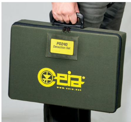
PD240 HAND HELD DETECTION SET WITH CARRY BAG